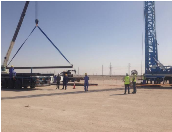
Conductor Pipes Client: Kuwait Energy Sub contract: Shams Al Adala Location Block #9 2016-2017