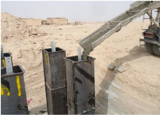
33 KV Double circuit OTL Clint: Basra Governorate Sub contract with ADG Company