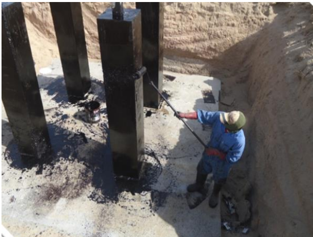
Total length: 25 KM Supply and construct OTL From 2011-2012 Location from Umm Qaser City