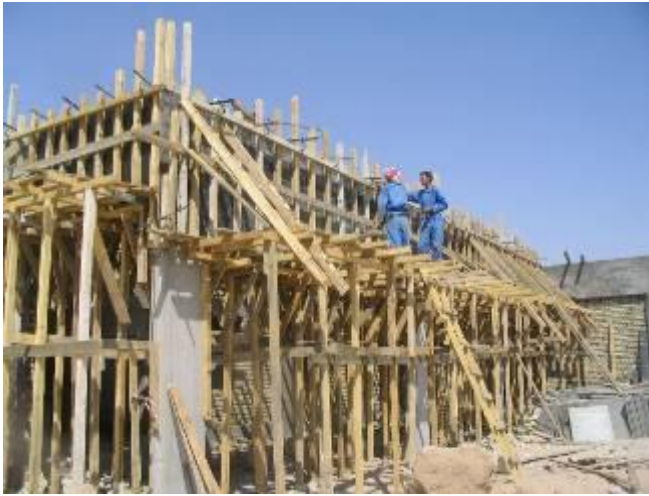
Construction concrete works Clint : ADG Location: Different Sits 2014-2016