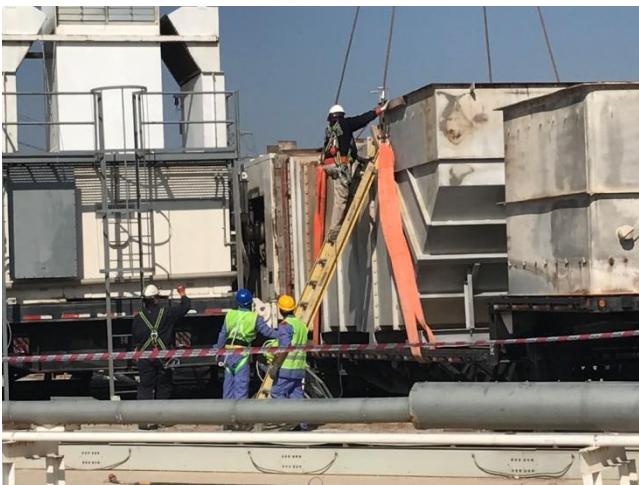
Dismantling 6 GT Units Clint: APR Energy Company 2016 Location : AL Hartha Power Plant