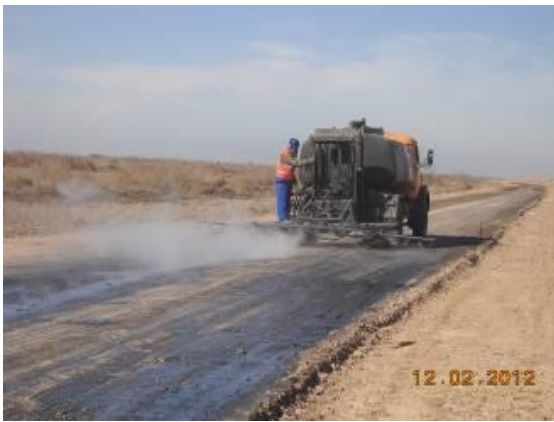
2013 Constructed 8 KM asphalted road Clint: SOC. Contract with: UNIOIL Company